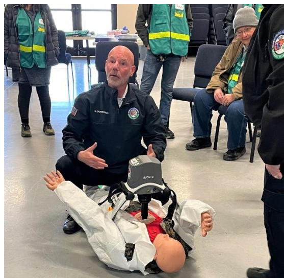
CERT Academy participants observing automated CPR device; 2.17.2024